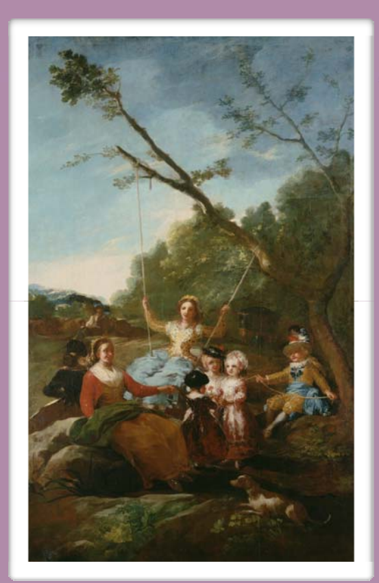
with a swing