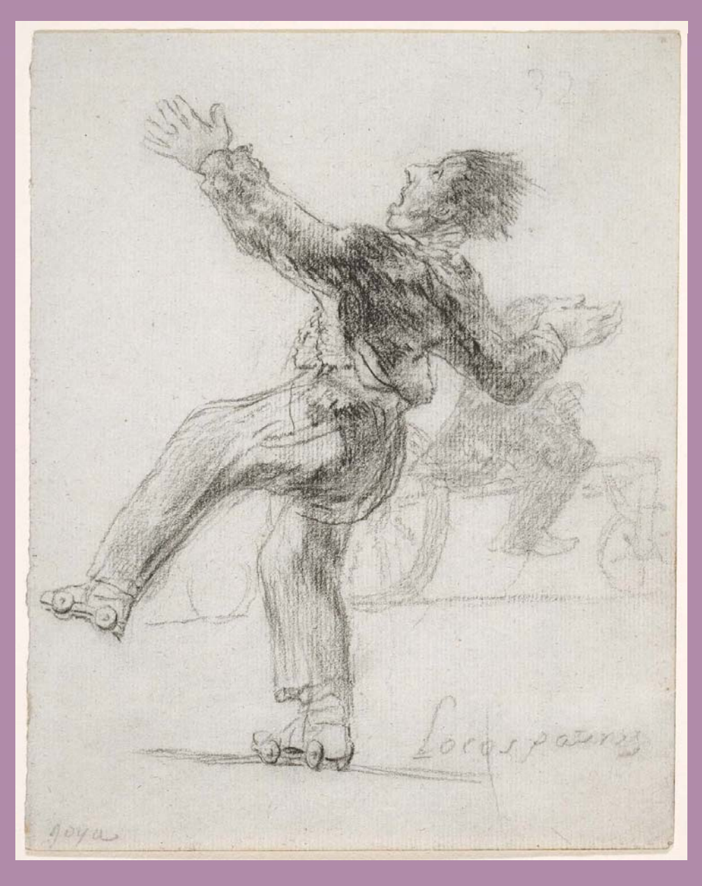
I called this painting "crazy skates"